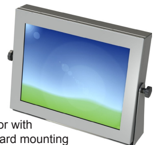
Monitor with Standard mounting bracket

The terms HDMI and HDMI High-Definition Multimedia Interface, and the HDMI Logo are trademarks or registered trademarks of HDMI Licensing, LLC in the United States and other countries. DisplayPort™ and the DisplayPort™ logo are trademarks owned by the Video Electronics Standards Association (VESA®) in the United States and other countries.